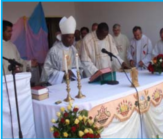
The Dedication Mass at the Formation House.