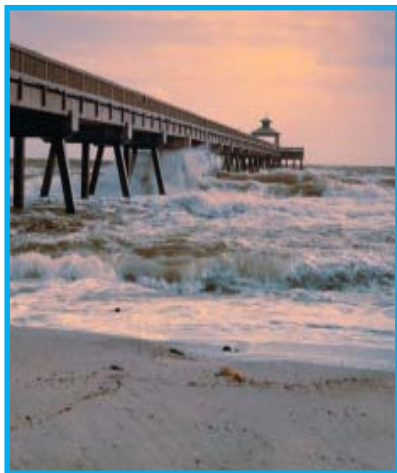
Cover: Photographer unknown