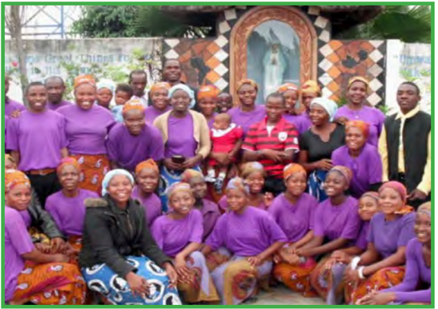
One of several choirs at Holy Family Parish. The purple shirts identify their particular singing group.

Our Pallottine parish, Holy Family Parish, prospers as members do more than passively sit at a Mass by actively participating in the parish's daily life. The people are proud of the many choirs they have formed to enhance the beauty of the liturgical celebrations. Their voices rival many of the choirs I have heard at home and in my travels. The parishioners have taken upon themselves at their expense to re-