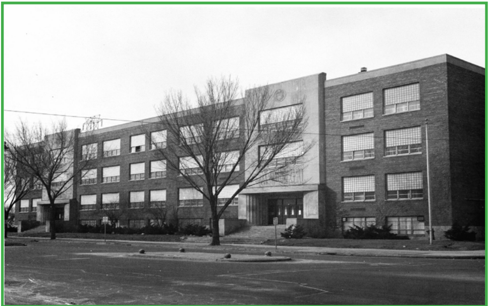
Front view of Pius XI High School from the 1950's and 60's.

Pius XI High School continued to grow during the late 1950's and early 1960's. The expansion of the mid-1950's and the apparent regularization of the Pallottine presence at the high school had worked out. However, the bonds that attached the high school to the parish were now strained to the maximum. Simply put, the people of St. Anthony parish wanted a new church and became less patient with the continual subsidization of the prosperous high school.