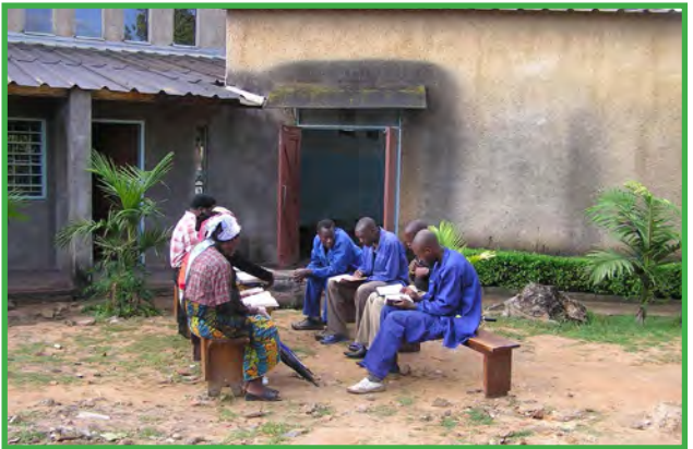
Parish catechists instruct those wanting to learn more about Jesus and the church.

place the metal folding benches in the church with new locally made wooden pews. Many others have volunteered their time and talents to teach catechism to those wishing to join the Catholic Church or to increase their understanding of the bible and the message of Christ. Again, your support has contributed greatly to the success of all these things at our Pallottine mission. Thank you!