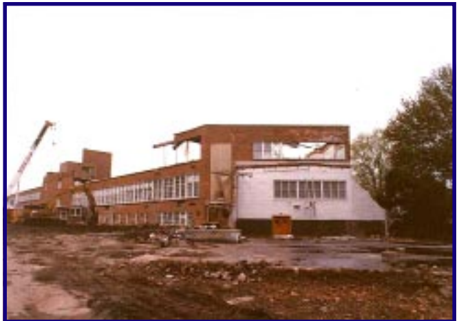
Back of school looking past the demolished gym (doors still in place) to the classrooms and beyond.