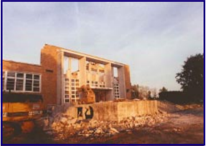
Front entrance of the school as it was being demolished.