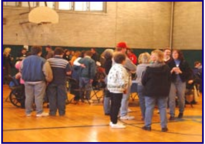
Former students, teachers & friends in the gym for the reunion.

Just a footnote: On July 26, 2009 a 30th anniversary all school QA reunion was held at St. Dennis Parish during their summer festival. QA still lives on!