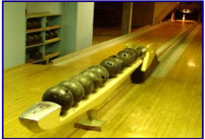
The famous two lane bowling alley in the basement of the school.