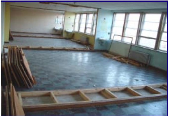
Wood paneling being saved from third floor dorms and library.