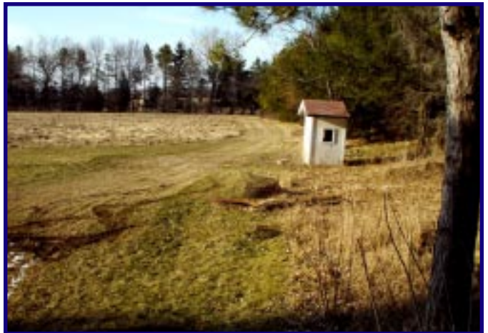
The once proud track and football field no longer in use.